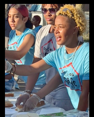
Young people gain confidence, leadership skills, and see their impact in the community through MissionSAFE